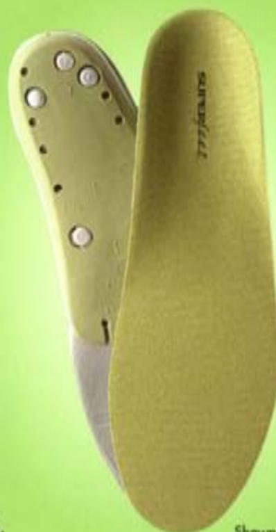
Shown here: Synergizer Green

Wearing Superfeet will help reduce foot pain and improve your overall health and well being. We guarantee it.